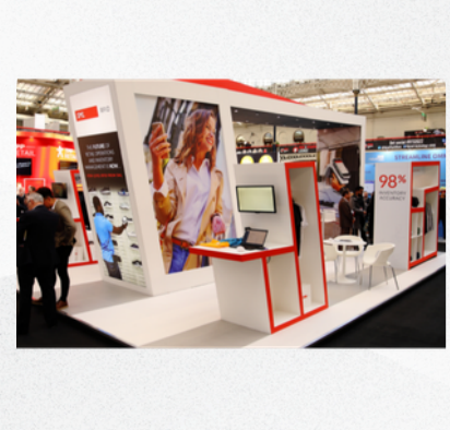
Exhibition & Event Graphics