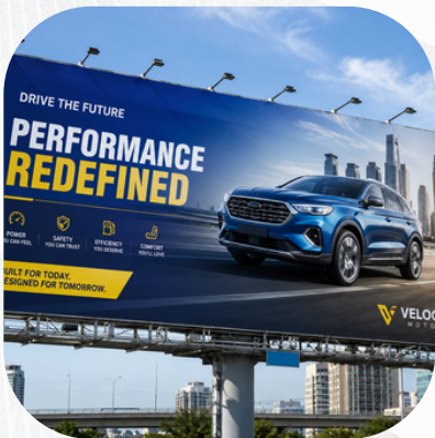
Billboards & Hoardings