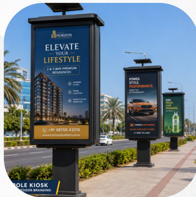
Pole Kiosk & Outdoor Branding