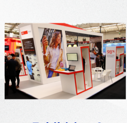
Exhibition & Event Graphics