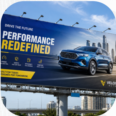
Billboards & Hoardings