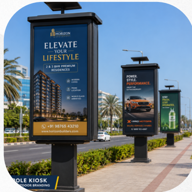
Pole Kiosk & Outdoor Branding