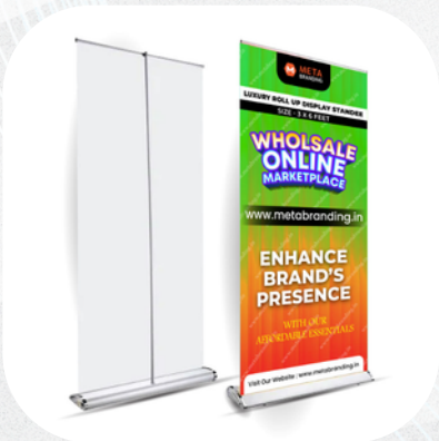
Retail Branding Displays