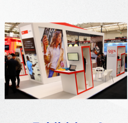
Exhibition & Event Graphics