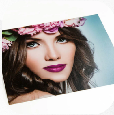
Photo Paper Printing