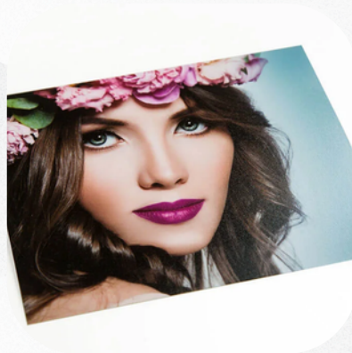
Photo Paper Printing