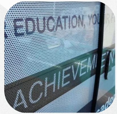
One Way Vision