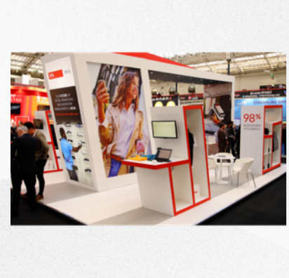
Exhibition & Event Graphics