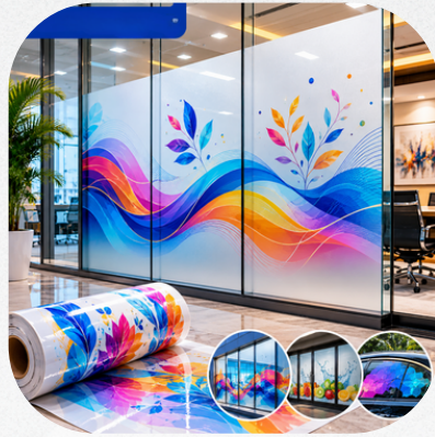
Glass Film Printing