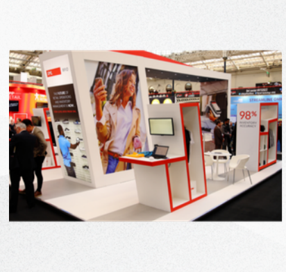
Exhibition & Event Graphics