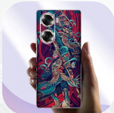
Embossed Phone Covers