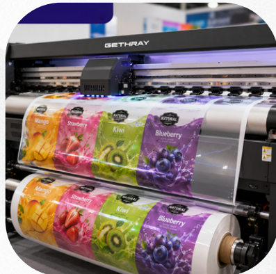
Soft Film Printing