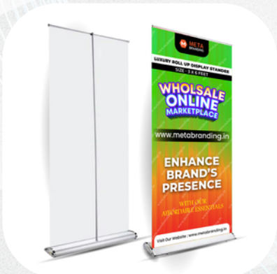
Retail Branding Displays